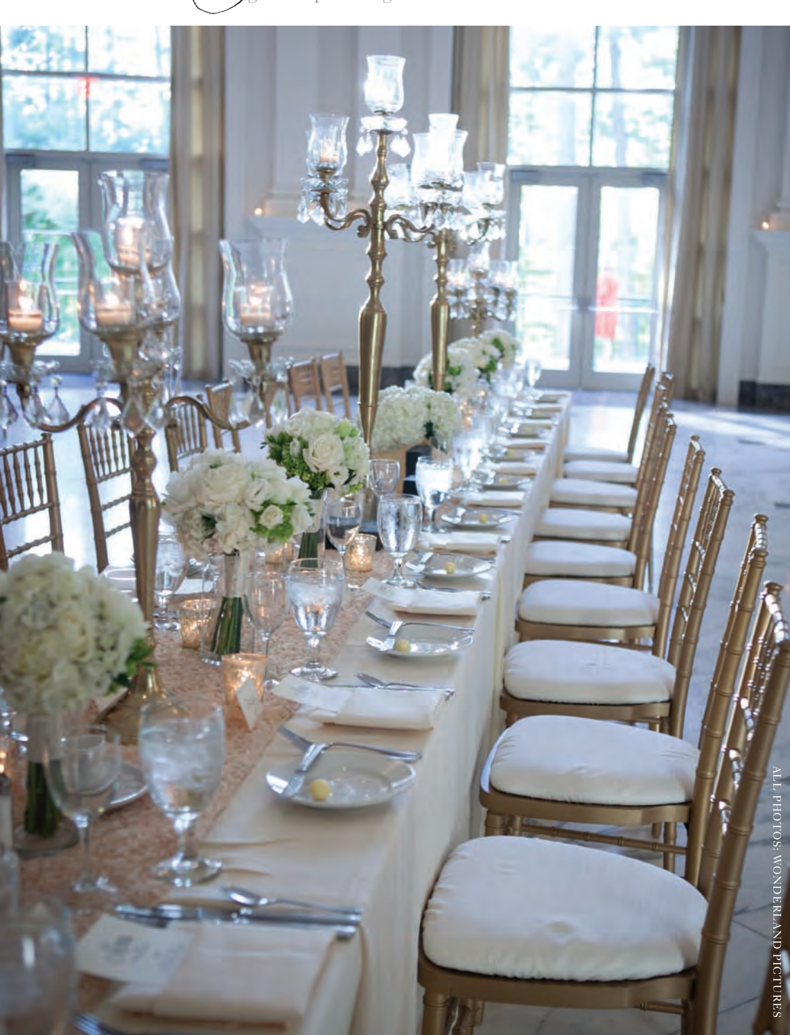
Personalized planning and coordination for memorable events.